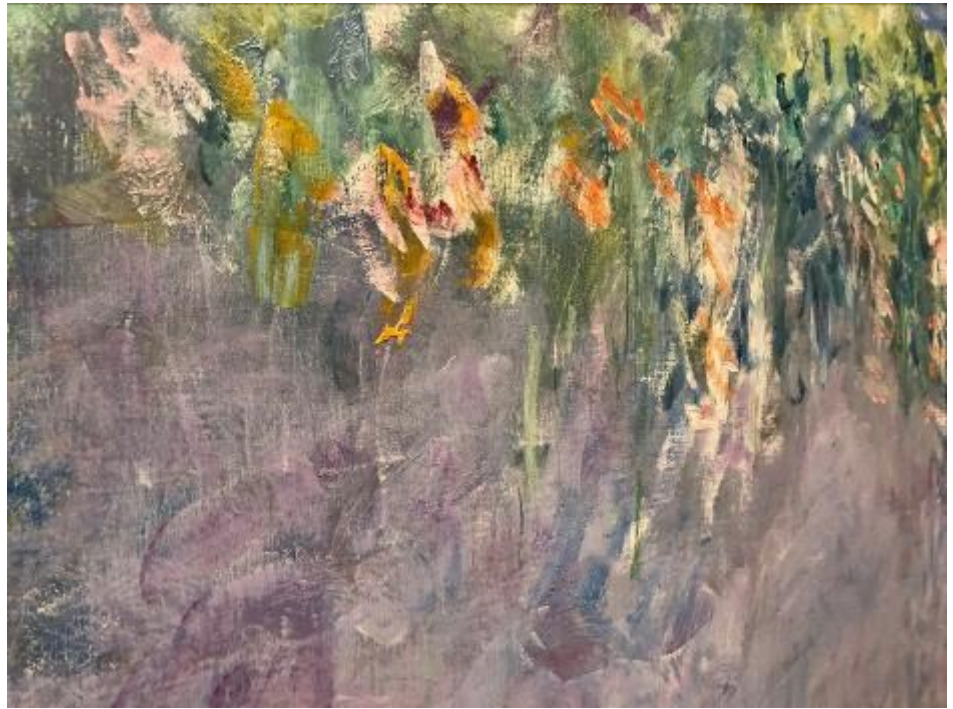
Texture and Color

Toward the end of the exhibit there is one series of 5 photographs whose main subject is a deciduous tree. It was well worth taking time to study the variations of color, the lighting, the moods Monet invoked. You can learn a lot from a tree, it seems.