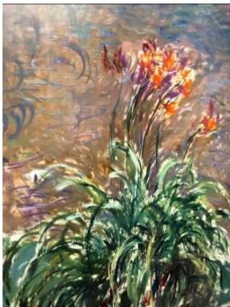
Layers of Paint