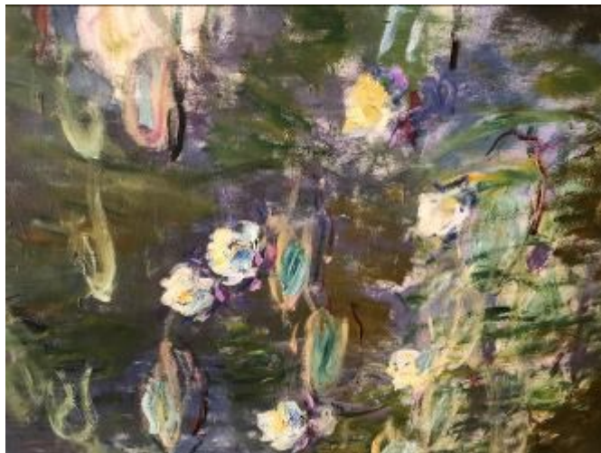
The Color of Blue Is?

During the tour I found myself confronting and having to work past several preconceived notions and suppositions. Up front I have always preferred Claude Monet’s earlier works and paid little attention to his later paintings, almost all of which are of the gardens he planted at his country home in Giverny, about 45 miles from Paris. Ah well, ignorance is such a fine thing! And lily pads – what do I care about lily pads as a subject? Well, let me tell you!