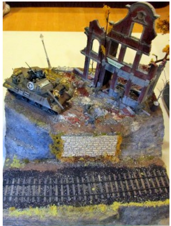
Chris Palermo's 1/48, 1943, Licata, Sicily, tank destroyer crew at ruined village above railway.