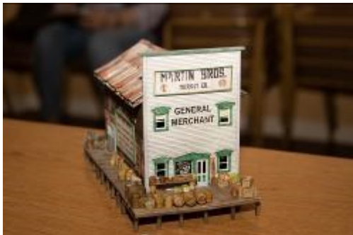
First Place Model