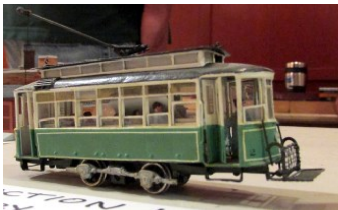
1st Place - Traction Bob Wirthlin's Birney Scratch Built in Brass