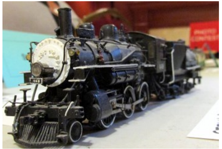
1st Place - Steam Bob Wirthlin's SP Mogul #448 Scratch Built in Brass