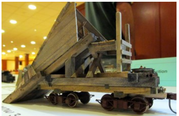
1st Place - MOW/Non-Revenue Frank Markovich's West Side Power House Snowplow Also Scratch Built