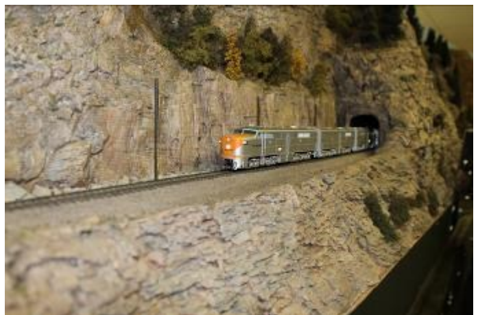
The Zephyr Heads Up The Feather Canyon