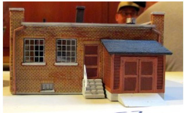
1st Place Tie - Structures Ronnie LaTorres' Section House & Industrial Building