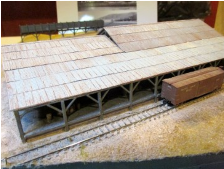
Tom Knapp's Pacific Coast Railway Port Hartford Asphalt