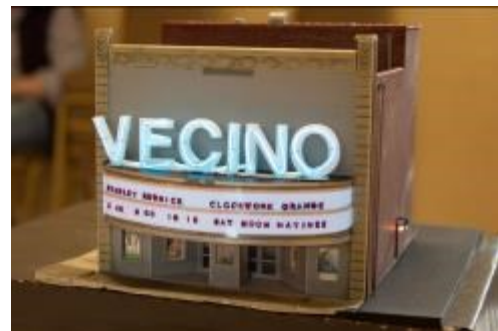
Third Place Model