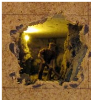
With a Little Peek-A-Boo!