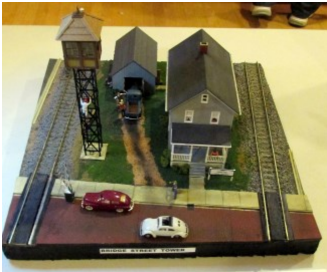
Tom Vanden Bosch's Bridge Street Tower