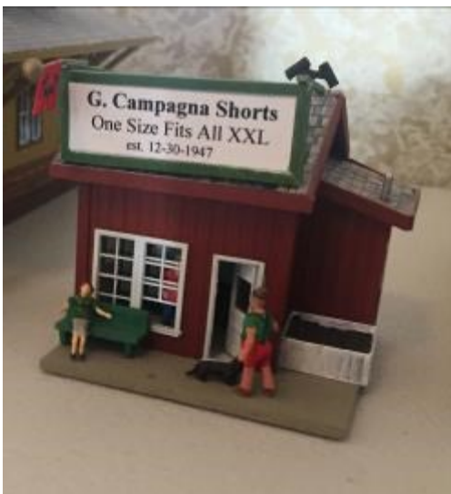
Model By Skip Rueckert

Kent Hinton presented a great program on his experience with 3D printing. His presentation included a 3D printer producing parts during the meeting. Kent's presentation covered cur-