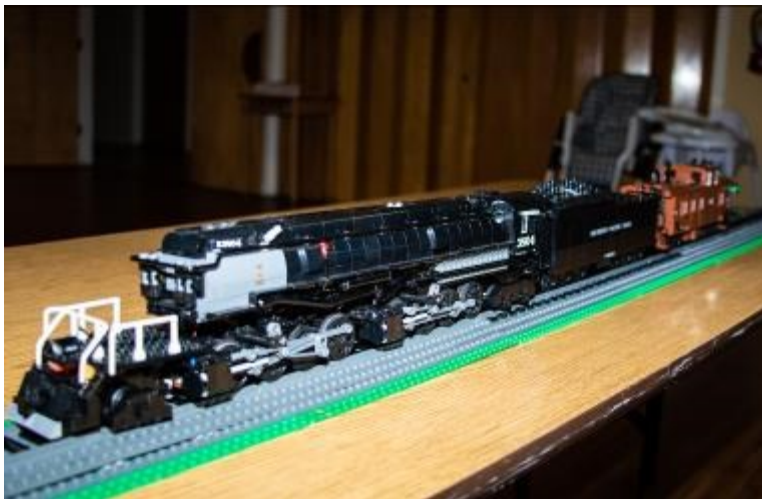
Karle Mahler’s Lego Loco

The contest categories were modeling, Structures, and photos, Model in Black and White. The lone photo entry was from Walt Schedler. The three top structures were Gary Ray’s General Store, 1st place; Walt Schedler’s MOW Yard and Speeder Shed, 2nd place; and Chip Meriam’s Vecino Theatre, 3rd place.