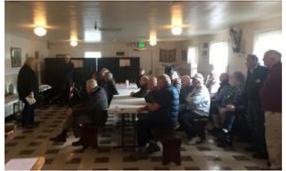
RED Members and Guests - Monroe Hall

Ten attendees brought items to present during the Show and Tell part of the meeting. Model structures, a book review, a holiday layout re-