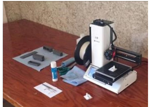
Kent Hinton's 3D Printer in Action

Visitors were given an overview of Peter's layout and ran a few trains. An article with additional pictures of the Bummelbahn may be seen in the Winter 2019 issue of the RED Callboard.