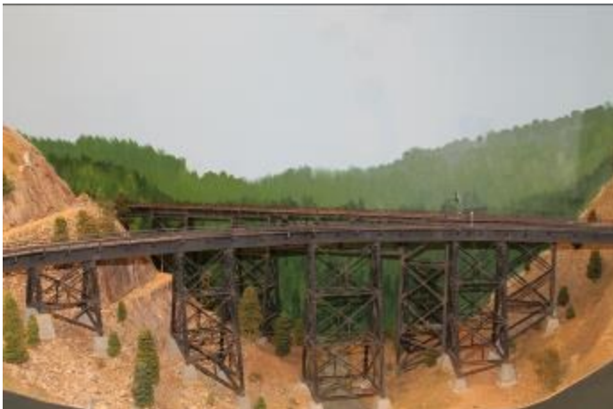
The Keddie Wye