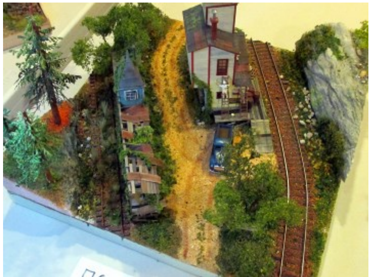
Bill Holst's Untitled