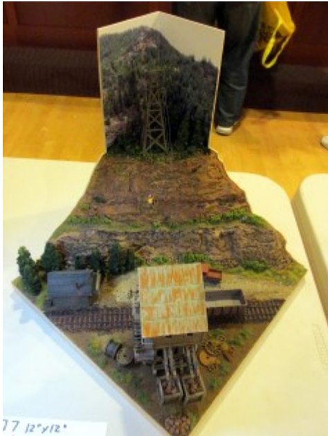
Don Burch's 12" X 12" Module