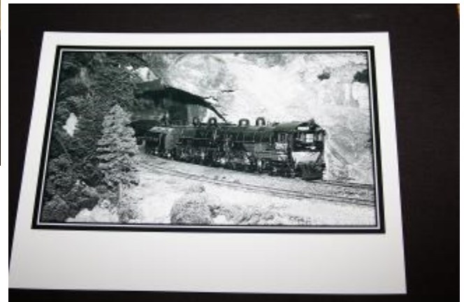
First Place Photograph