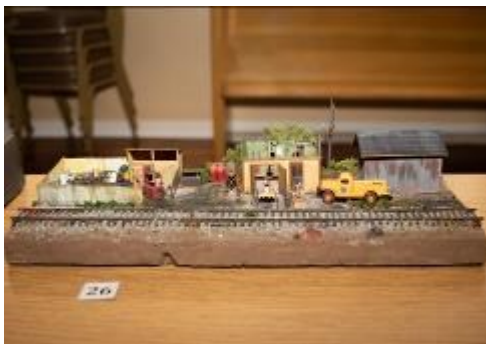
Second Place Model