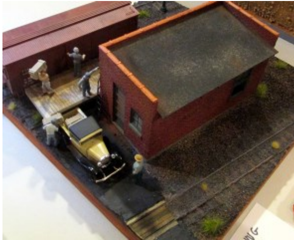
Pat LaTorres' 12"x12" Challenge: Switching Yard