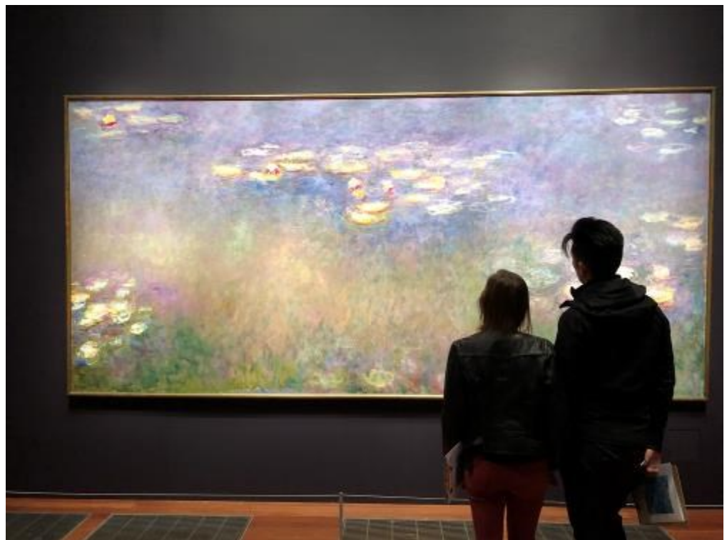
The Really Big Pictory