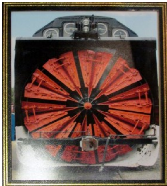
1st Place Photo - Unpowered Rolling Stock Stanley Keiser's Rotary