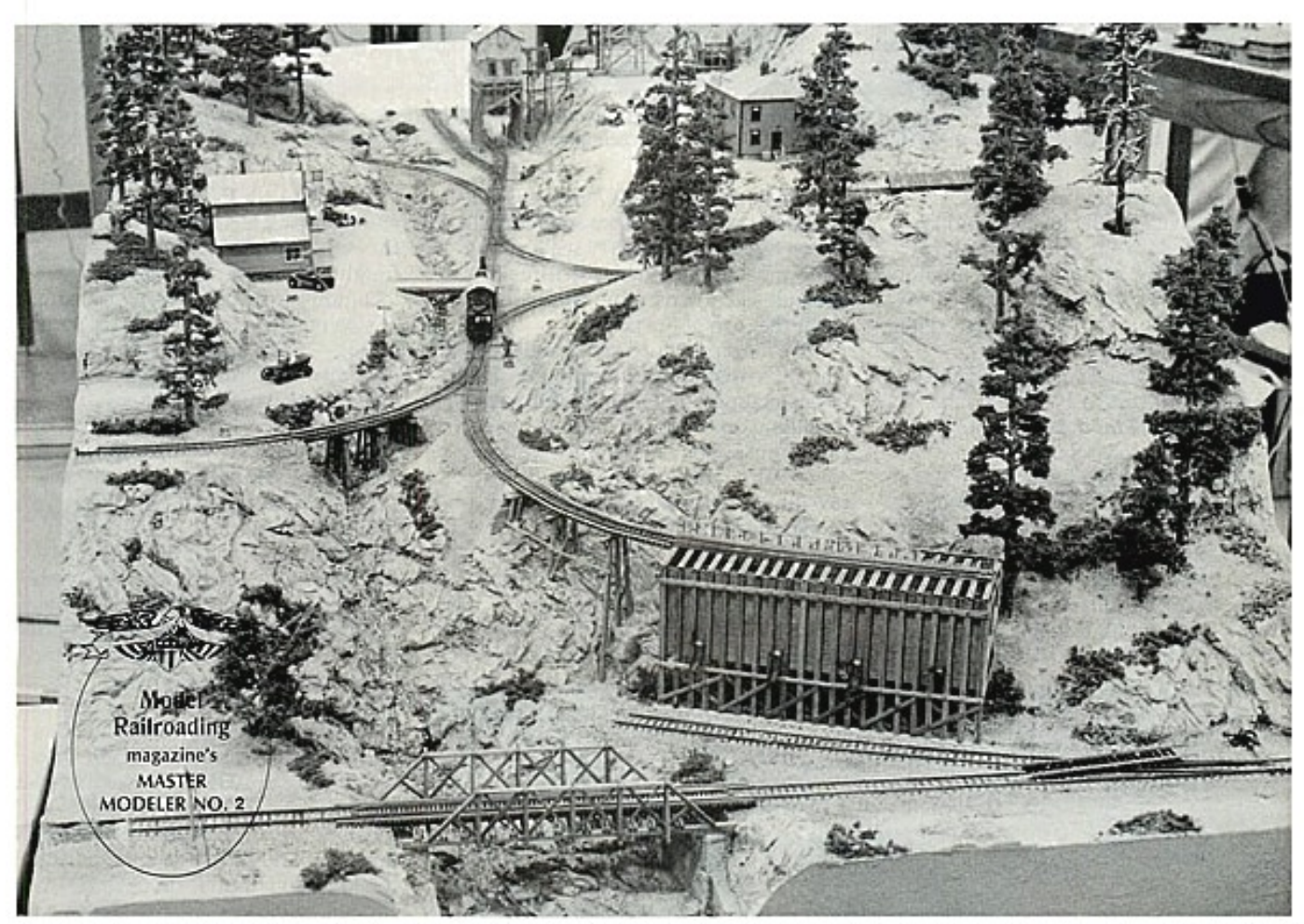
An overview of the 2 x 4-foot Adelaide mining/switching module as it appeared back in 1977. Most of these structures are Gloor Craft, Railhead or Muir kits. The trees are Woodland Scenics kits.

The advent of Marklin's Z scale locomotives and track has made it possible to build and operate a complete model railroad in the smallest space ever. Since the real railroads used tighter curves on most narrow gauge lines than they did on standard gauge, the ½20 scale curves of Z scale work ought to be about right for the ½60 scale curves of N scale narrow gauge. It's also helpful, of